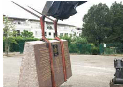
The Craftsmen in Stone move the Victoria Cross Memorial Full story on page 2